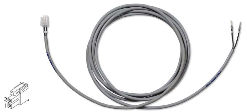
Figure 3-2 Power Cable