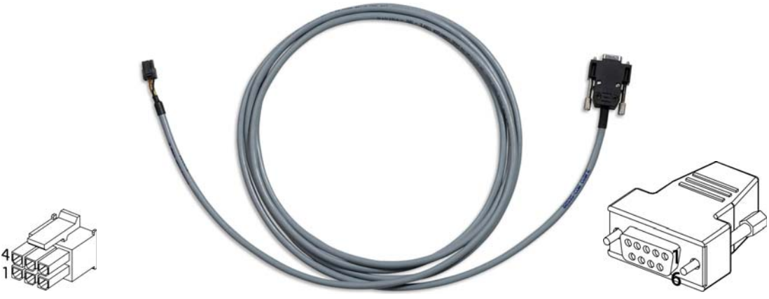
Figure 3-7 RS232-COM Cable