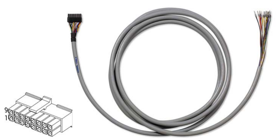
Figure 3-6 Signal Cable 16core