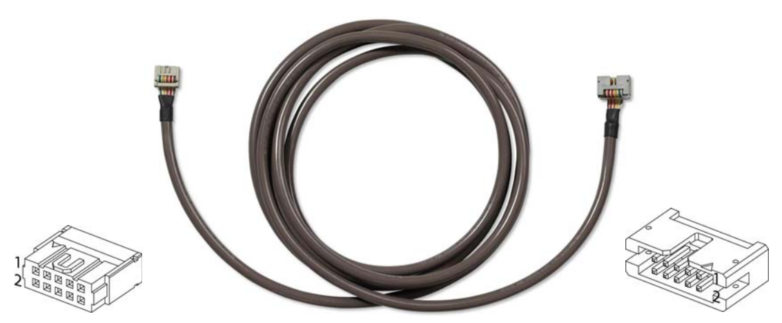
Figure 3-5 Encoder Cable