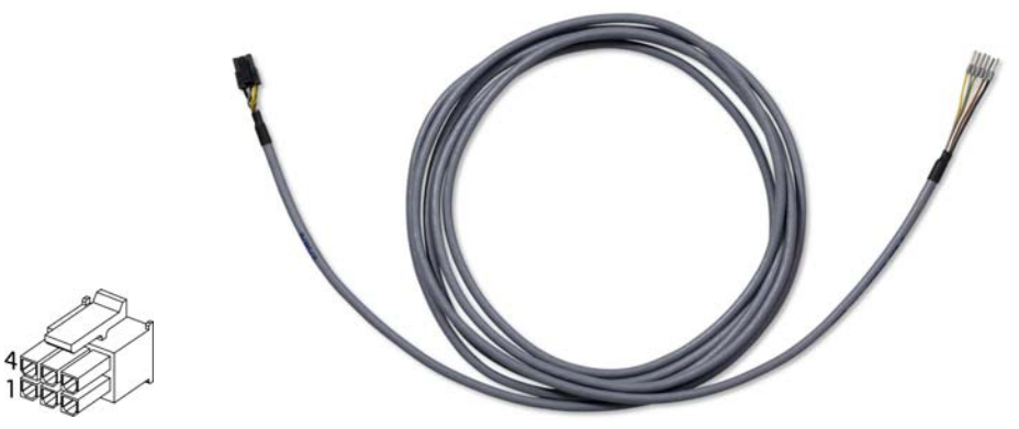
Figure 3-4 Hall Sensor Cable