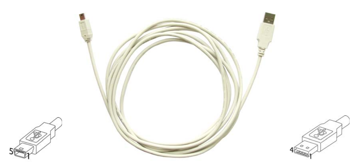
Figure 3-8 USB Type A - mini B Cable